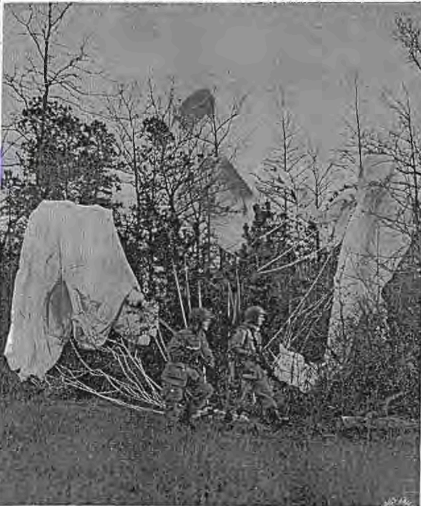
Yes, ladies, these are your silk stockings . . . but they were removed with care . . . and how we love 'em!