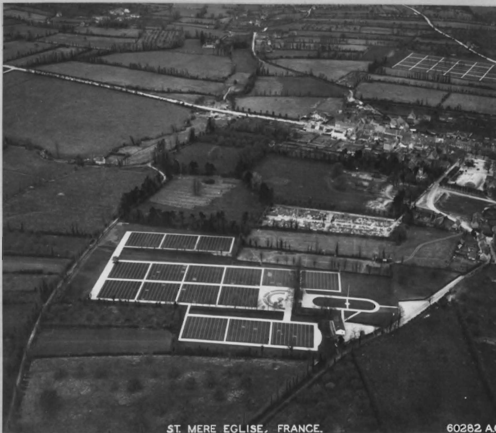
ST. MERE EGLISE, FRANCE.

9x9 Negatives rec'd from Personal Affairs Branch, Office Service Unit, 23 April 1946.