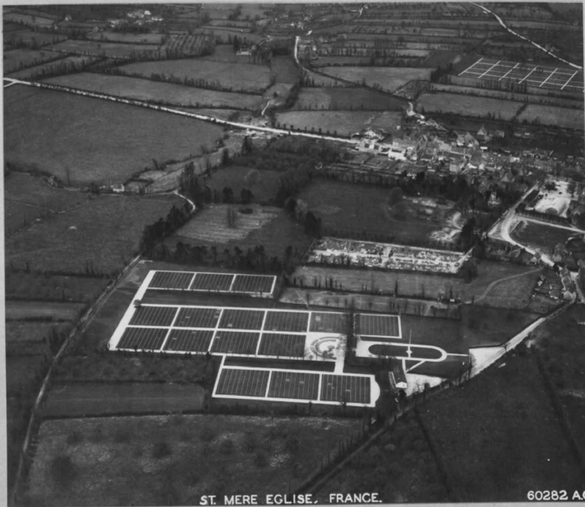
ST. MERE EGLISE, FRANCE.

9x9 Negatives rec'd from Personal Affairs Branch, Office Service Unit, 23 April 1946.