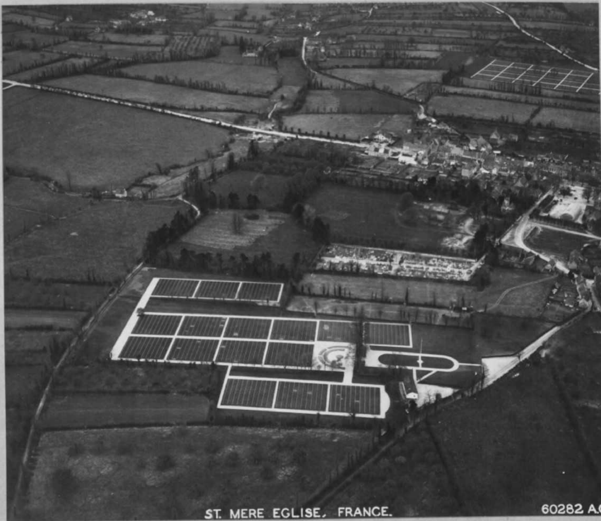
ST. MERE EGLISE, FRANCE.

9x9 Negatives rec'd from Personal Affairs Branch, Office Service Unit, 23 April 1946.